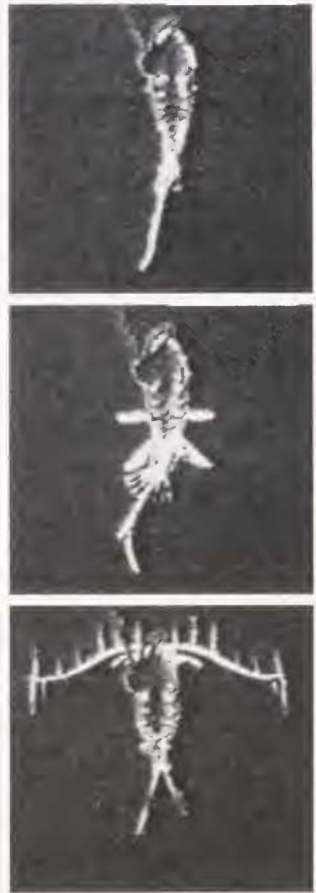
Figure 1. Escape postures of Euchaeta rimana adult female (prosome length = 2.4 mm). (Top) Streamlined body form during escape glide of copepod moving at Reynolds numbers greater than 500, showing antennules parallel to body, swimming legs folded close to body, and caudal rami collapsed into a narrow tail. (Middle) Body form during power thrust of the escape, showing antennules folded parallel to body and exopods of the swimming legs extended and caudal rami flared. (Bottom) Body form when swimming and hovering prior to escape, with antennules positioned at right angles to body. The panels were placed in this spatial order to depict how the body form changes in the direction of an upward escape.

Not only is the skeletal system designed for maximum efficiency, but the resultant body form further allows copepods to attain and maintain maximum observed escape speeds of 1 \text{ m s}^{-1} (Fields and Yen, 1997) to enter into the inertial realm of Re = 1000 . When executing an escape, the copepod adopts a profound change in morphology—from an expanded form to a smooth streamlined shape (Fig. 1). In the expanded non-escape posture, the horizontal caudal fan may be important in controlling the pitch, or attitude, of the copepods and also may act as a stabilizer in reducing roll about the longitudinal axis (Strickler, 1975). In the streamlined form, the copepod may spiral around its central long axis (pers. obs.). In this escape posture, streamlining changes the pressure field behind the copepod where the fluid gradually decelerates in the rear, little or no separation occurs, and the object is literally pushed forward by the